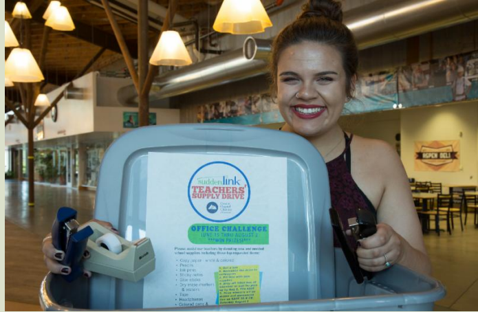
Donation boxes for the Teachers' Supply Drive are located near the main entrances of CCC's Lone Tree and Fourth Street campuses.